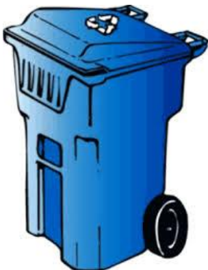
Blue cart, Green Community!

Arcola Town council is excited about this new program, and feels the benefits will outweigh the costs! Some important points to know with this new program are as follows: